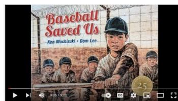
Baseball Saved Us: The Movie

https://www.youtube.com/watch?v=Edf64unhJw4&t=5s