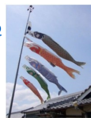
Flying Koinobori over the roof tops in Japan, 2005.

https://www.youtube.com/watch?v=NEqsHt1IIZ0 https://www.youtube.com/watch?v=32psmx4aDnQ