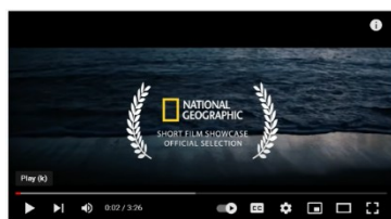
Hula Is More Than a Dance—It's the 'Heartbeat' of the Hawaiian People | Short Film Showcase

https://kids.nationalgeographic.com/geography/states/article/hawaii-1